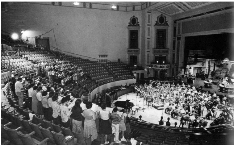
Cleveland's Masonic Auditorium where these recordings were made