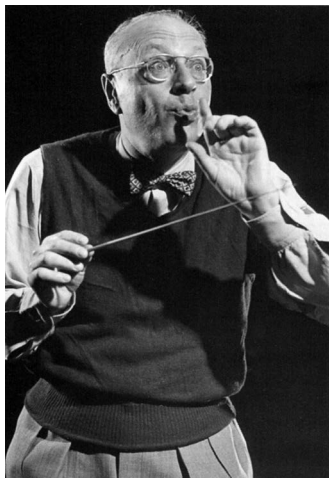
During a rehearsal in the late 1940s

Szell's first commercial recordings with the Cleveland Orchestra date from April 1947 and contain repertoire that would be central to his recorded legacy – a selection of Dvořák Slavonic Dances in new editions prepared by Szell, Beethoven Symphony No.4 and Mozart Symphony No.39, all for Columbia Records. But in the several years to follow there was increasing frustration from the Board of Directors at the lack of attention being paid to the orchestra by Columbia. With the orchestras of Philadelphia and New York making records by the dozens, Cleveland had “in Szell's nine years... recorded only 14 pieces”, according to a Cleveland Press writer.